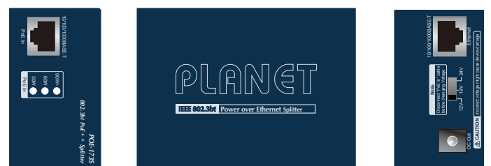
Figure 1: POE-173S Outlook